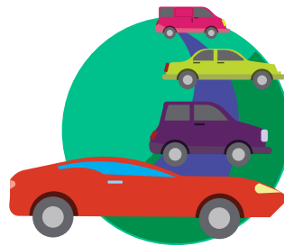
Buying a Vehicle