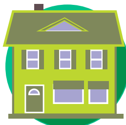
Buying a Home